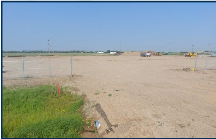
Fenced and gated site